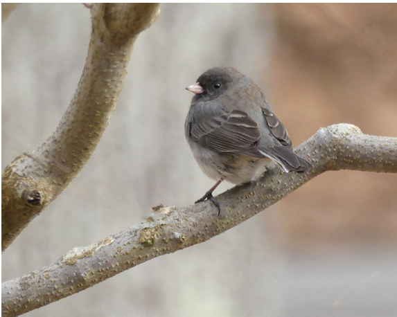
Junco (simplified)