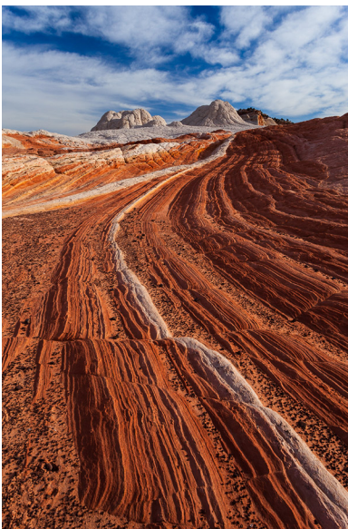
Leading Lines; photo Ed McGuirk

Our more-or-less-semiannual member images night was held at our Nov. 14 meeting. Two themes were offered - "Nature Leads Us In" or "Surprises." Eight members brought images.