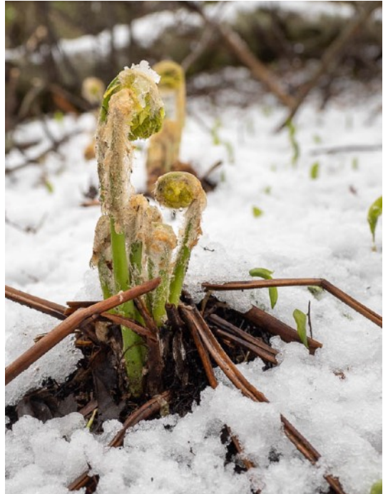
New England Spring Colors; photo, Hendrik Broekman