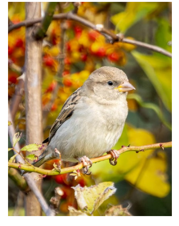
Sitting Pretty

I especially invite presenters and members sharing images to select and submit files for illustrative purposes. I expect it would be possible to accommodate two images or so for main presenters and one each for after-presentation sharing. Generally, expect to see half-column layout along the lines of this example. If you have photos you may wish to share, please submit jpg files sized no smaller than 1200 px on the long side. Submission deadline will be 11:59 pm on the Monday following the meeting. Inclusion in any particular newsletter will be at my discretion based on newsletter length, distribution file weight, current workload, etc.