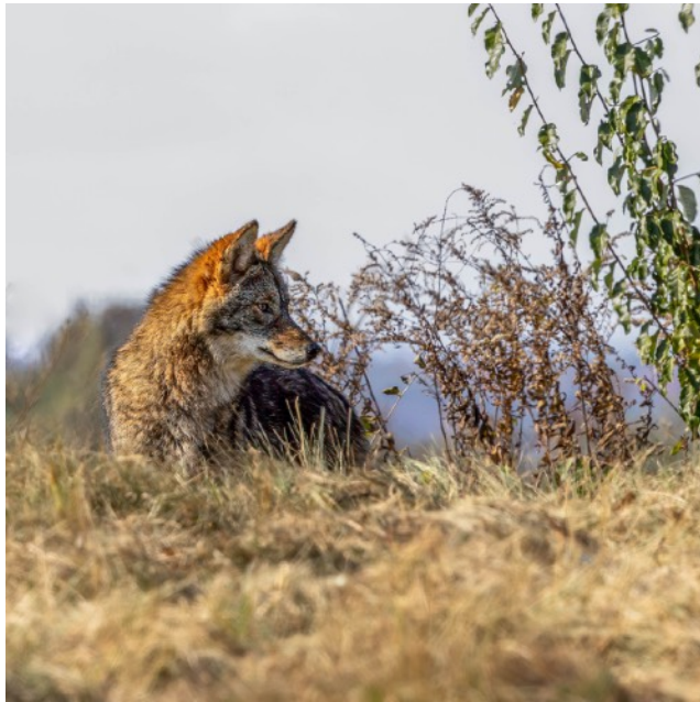
Coyote