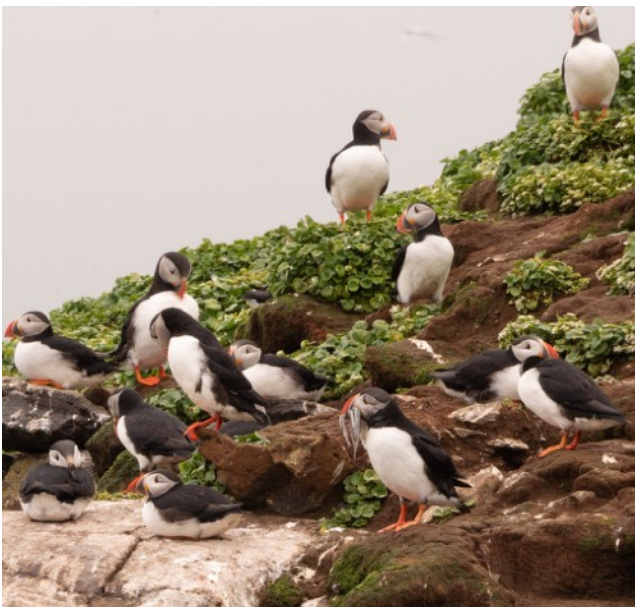
Puffins on Grimsey Island

Anne Umphrey's fascination with Iceland continues undiminished. She started by showing images taken on Grimsey Island, part of which is the only bit of Iceland to lie north of the Arctic Circle. She had several pix of Puffins to display. There were also one each of a Barred-Tail Godwit and a Golden Plover. This Plover is cherished in Iceland where its arrival is taken as the first sign of Spring. Anne finished her