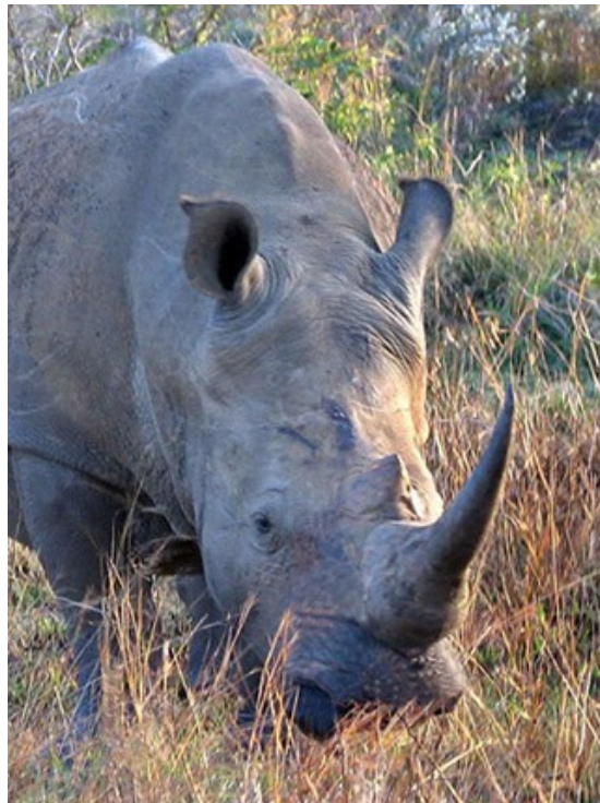
Southern White Rhinoceros aka Square-Lipped; photo, Mark Hopkins

In 2004, as an Earthwatch volunteer, Mark Hopkins participated in the biennial herbivore census at the Hluhluwe-iMfolozi game reserve in South Africa, established at the end of the nineteenth century and now designated a park. The reserve is noted for its contributions to the conservation of the southern white rhinoceros. The growth of this population from around 100 animals worldwide at one point early in the twentieth century to around 20,000 in the wild in 2015 speaks to the success of the project. The park aims to maintain a population of about 1000 white rhinos (this works out to an average of about 3 animals per square mile) and it is to this purpose, as well as the general management of resources for all animals in the park, that censuses are performed.