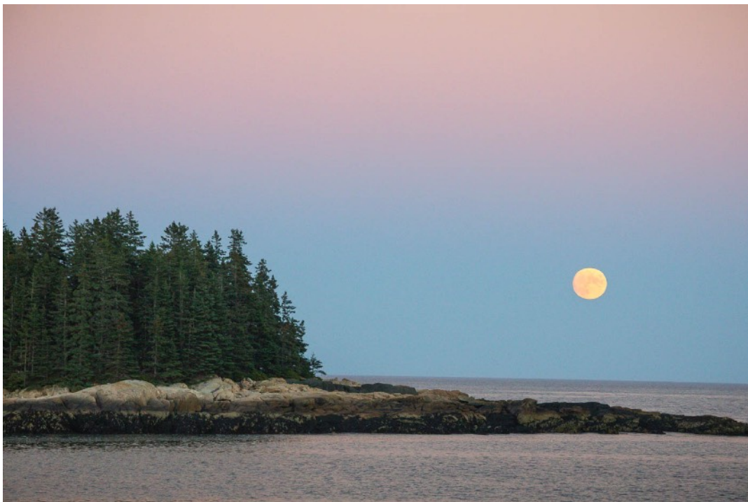
Moon in Earth's Penumbra, Acadia, ME; photo, Ed McGuirk