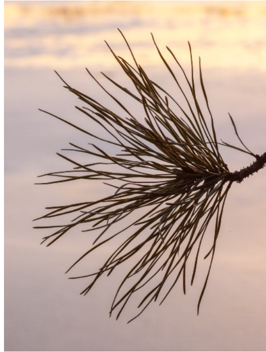
Golden Hour at Heard Pond