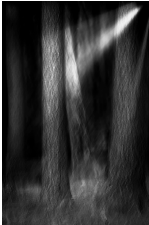
Mystery in the Woods - Deep in the woods surrounding Walden Pond