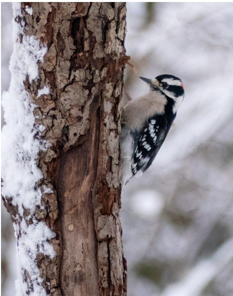
Downy Woodpecker

Barbara Peskin opened with a photo of a female cardinal in snow. She continued with one of a Downy Woodpecker to illustrate the power of content-aware fill to remove distracting elements from an image. This provoked a bit of discussion. We were then treated to further images including a mess of cardinals, a nuthatch, a squirrel (“I think he’s cute.”) and a backyard scene from warmer times