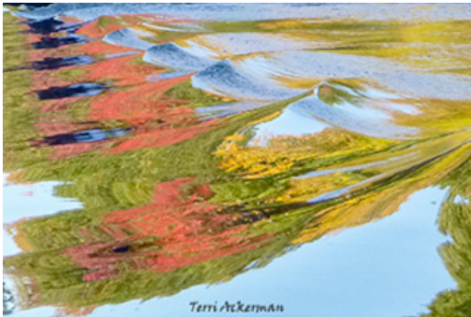
Boat Wake; Terri Ackerman, 2015

The program started with Terri Ackerman speaking on the subject of abstract nature photography. Among the many approaches Terri mentioned for rendering photographs less easily identifiable and thus more abstract, perhaps the most prevalent was zooming in on details, either by a lens zoom or by cropping. Other