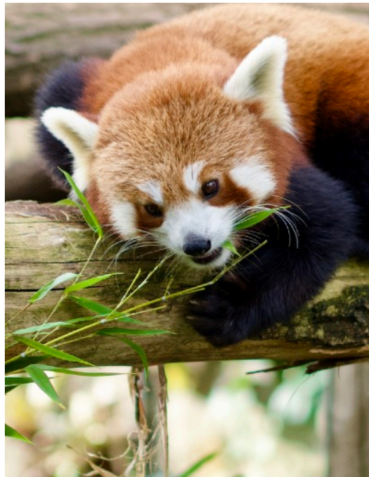
Red Panda, Jardin des Plantes, Paris; photo, Hendrik Broekman