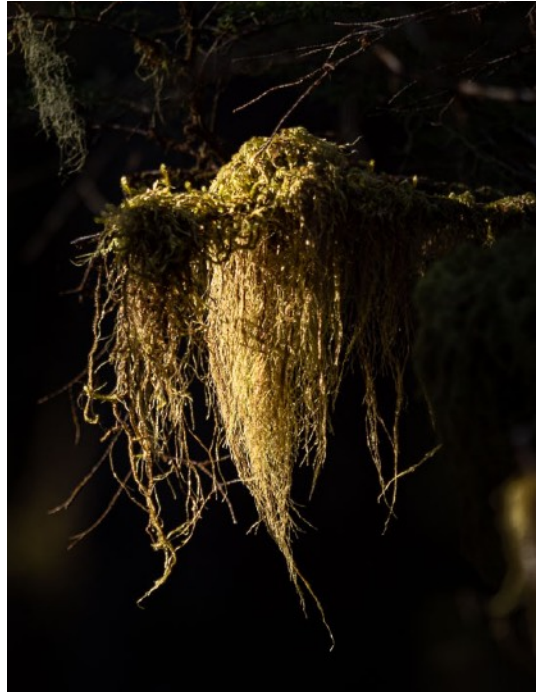
Alaskan Tree Beard