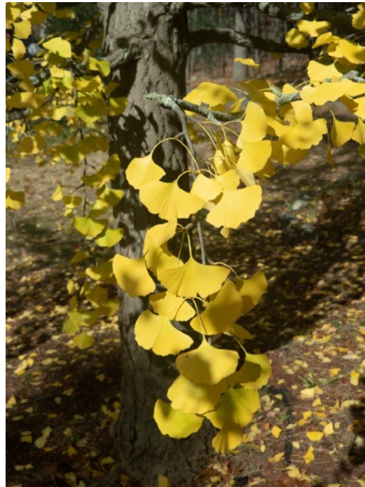
Ginkgo turning color, 2017