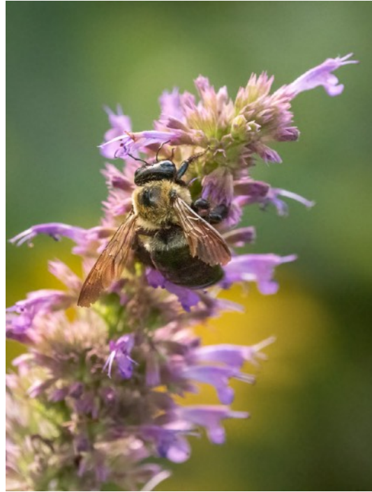
Late Harvest