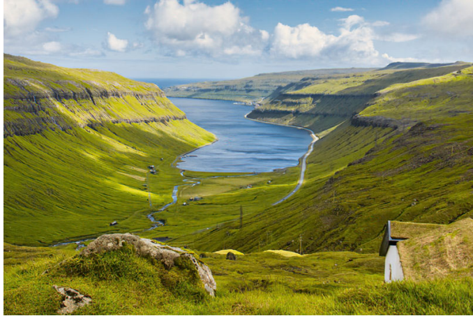
Faroe Islands