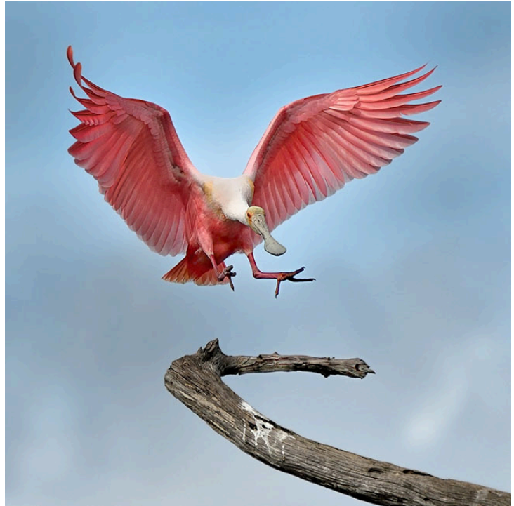
Spoonbill Landing; photo, Doris Monteiro

encountered and chatted up. Maps helped orient viewers to the various locations, which run the gamut of uses. They go wherever the birds are to be found, whether that may be a wildlife reserve, private concession or small city park. For instance, burrowing owls have chosen to nest in a sports park that includes a heavily-used velodrome (Brian Piccolo Park, Cooper City, FL). Who knew?