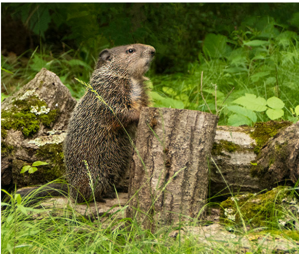
Woodchuck