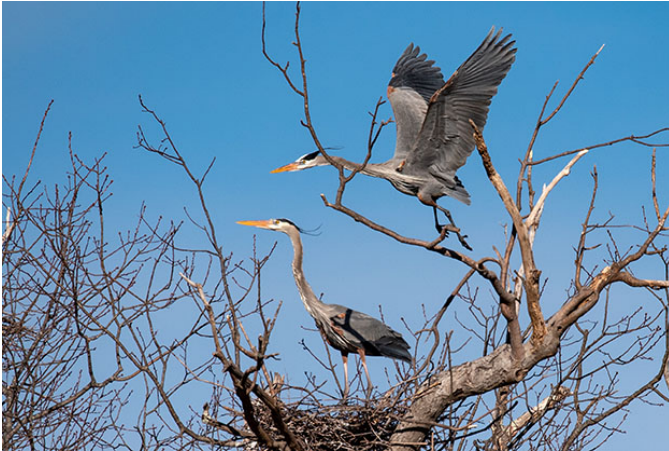
Nesting