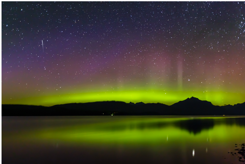
Glacier Park Northern Lights

Raj Das had on offer a series of quite accomplished landscapes taken very recently while moseying for two weeks around Glacier National Park as a guest in a friend's RV. Besides these, shot chiefly at the shoulders of the day, he also engaged in some night photography involving the aurora and/or the milky way.