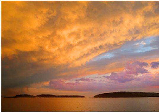
Clouds

of-focus tree branches in the background. The final image was of the Milky Way taken in Menemsha, Martha's Vineyard – astonishing to think of skies that bright in Massachusetts!