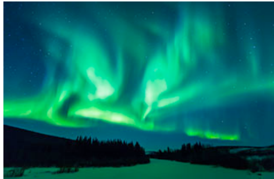
Aurora; Photo by Ed McGuirk

Ed McGuirk offered a very enjoyable slide program of images shot in temperatures of extreme cold (20 below ... or worse!). Places visited were the Gates of the Arctic National Park (auroras galore, above), Vermilion Lake in Banff National Park (with open water at 25 below thanks to hot springs) and the polar bears of Churchill Manitoba (40 below).