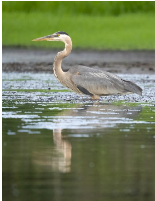
Heron on the Sudbury