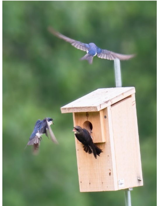
Helicopter Parenting