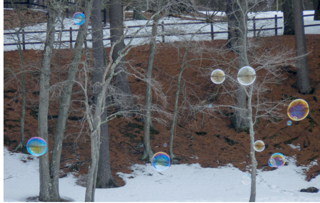
Bubbles – Wayne Hall

Wayne followed with intriguing images of bubbles being blown by a family group at Walden Pond – wait for it – in the snow! Close-up views of Marsh Marigolds taken at Gray Reservation helped demonstrate the power of varying point of view.