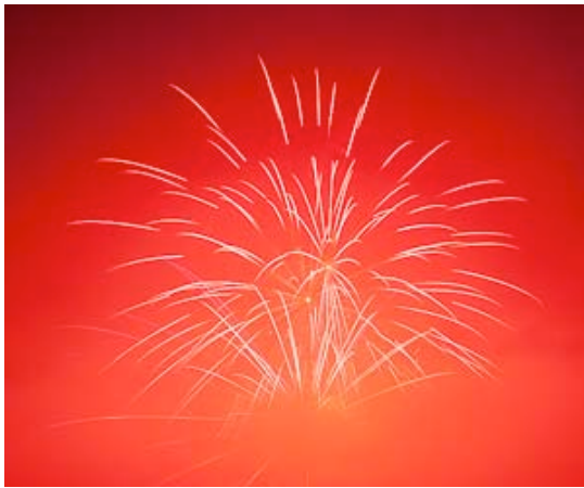
Untitled, Katherine O'Hara

impetus for Katherine to approach their post-processing as images focused on graphic design and color.