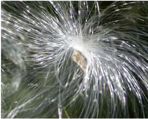
Explosion, Terri Ackerman

Terri Ackermann showed images of wildlife from the greater area, mostly from SVT properties. Requesting a sense of the meeting, the last image, of milkweed found at Hazel Brook, was presented in original form, heavy crop (~ 1/4 frame) and an even heavier crop (~ 1/16 frame). The attendees could not agree on an approach to the image although your writer detected a tendency to favor the lighter crop.