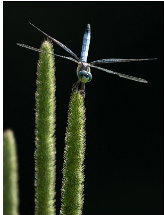
Blue Dasher