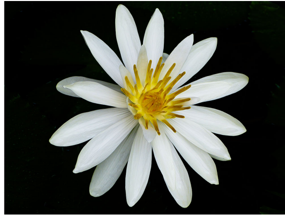
Saint Lucia - Water Lily

Stephen Gabeler showed a series of photos from a recent trip devoted to a series of day hikes in the American southwest. The route was a loop starting and ending in Las Vegas and included, in Arizona, the southern rim of the Grand Canyon, and the area around Page. In southwest Utah they visited areas around Zion NP and Snow Canyon SP. Finally, before returning to the airport for the trip home, a visit to Valley of Fire SP in Nevada was in order. A few images of Kaaterskill Falls in New York leant a watery balance to the western red rock.