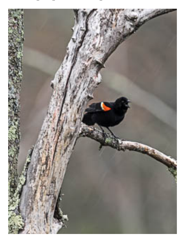
Singin' in the Rain; Photo, Hendrik Broekman

possible to accommodate two images for main presenters and one each for after-presentation sharing. Generally, expect to see halfcolumn layout along the lines of this example. If you have photos you may wish to share, please submit jpg files sized no smaller than 320 px wide. Submission deadline will be 11:59 pm on the Monday following the meeting. Inclusion in any particular newsletter will be at my discretion based on newsletter length, distribution file weight, current workload, etc. Hendrik Broekman