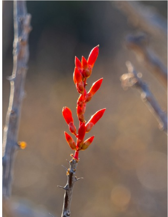
New Growth