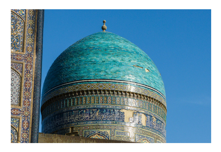
Dome in Bukhara, glazed brick; photo, Terri Ackerman

the fortress is a nononsense structure, whose walls have been repaired many times in its life, the interior city is a gem. In a similar vein, the other three locations feature grand architecture largely commissioned by prominent political actors. They are all decorated with an emphasis on Islamic-appropriate