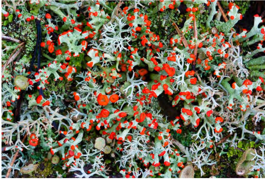
British Soldier Lichen