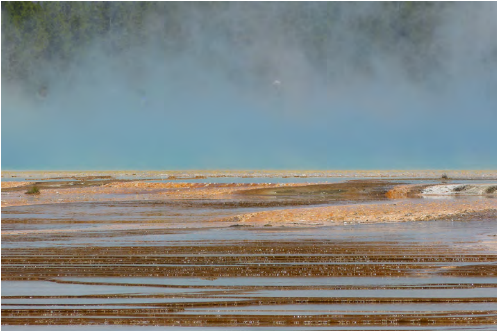
Yellowstone Reflections; photo, Terri Ackerman

Terri Ackerman showed a series of images taken in and around Yellowstone National Park. In the spirit of the evening, several images of the Grand Canyon of the Yellowstone were offered as abstracts.