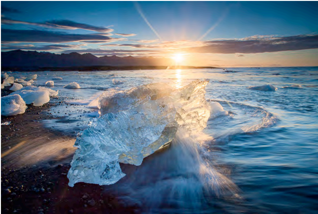
Iceland Sunrise

Ed McGuirk showed several photos taken on a past trip to Iceland coinciding with the summer solstice. The wildlife shown included Puffins, Red-Throated Loons, and a Kittiwake rookery. A shot of cinder cones was appropriately moody. One series of photos dealt with icebergs calved from the Breidamerkurjökull Glacier. The bergs that had not yet left Jökulsàrlòn lagoon were imposing. On the beach outside the lagoon could be found bergy bits that had been much reduced and polished by time at sea. Ed's photos from the