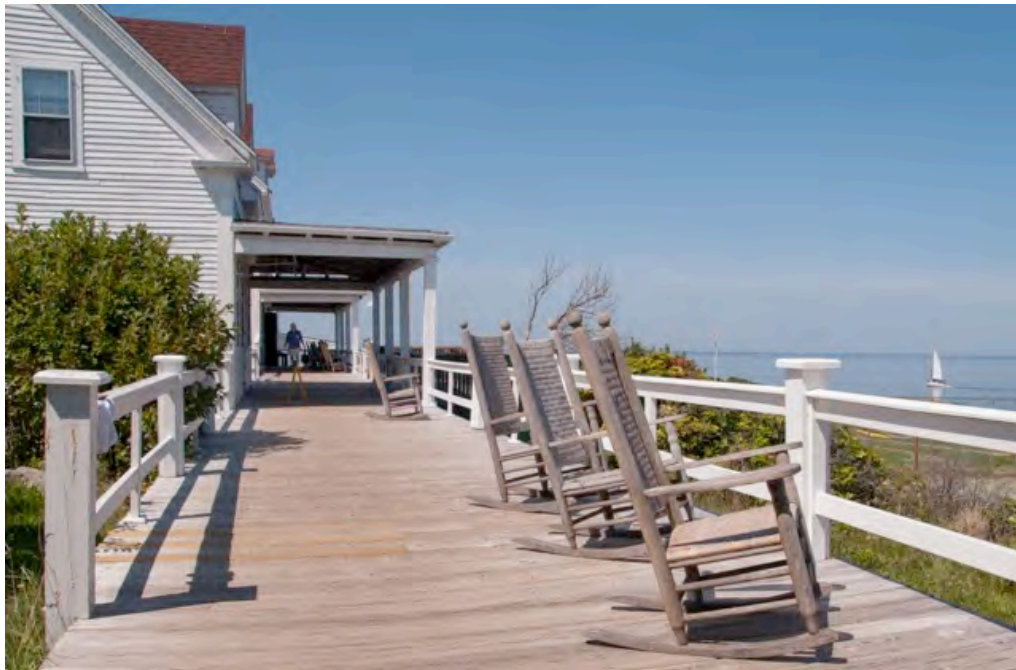
Island Life; Photo, Anne Umphrey

Anne Umphrey offered a view of the Gloucester Lighthouse with empty beach chair, a fanciful island (a rock in a tide pool) and two images shot at the Isle of Shoals. Some lively discussion ensued.