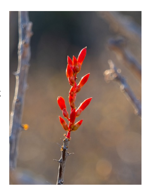
New Growth