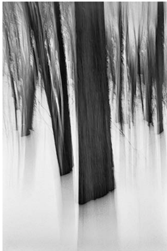
Intentional Camera Movement; Photo by Raj Das

The first course was devoted to shooting black-and-white film (Ilford HP5, 400 iso) and scanning it for use in the digital workflow. The course took place over one of New England's snowiest winters so the majority of these images included snow, which adds as much complexity to calculating exposure as it simplifies composition. Raj's final project in this course was entirely devoted to intentional camera movement. He remarked that he wanted the images to mimic charcoal