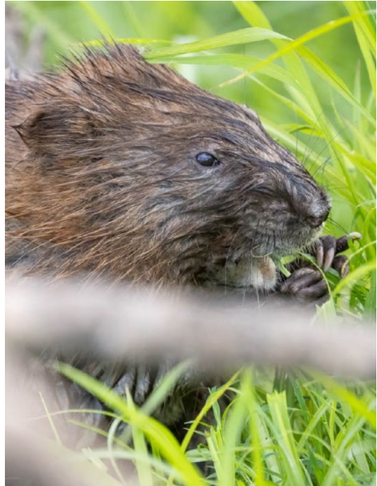
Delicacy, thy name is Muskrat