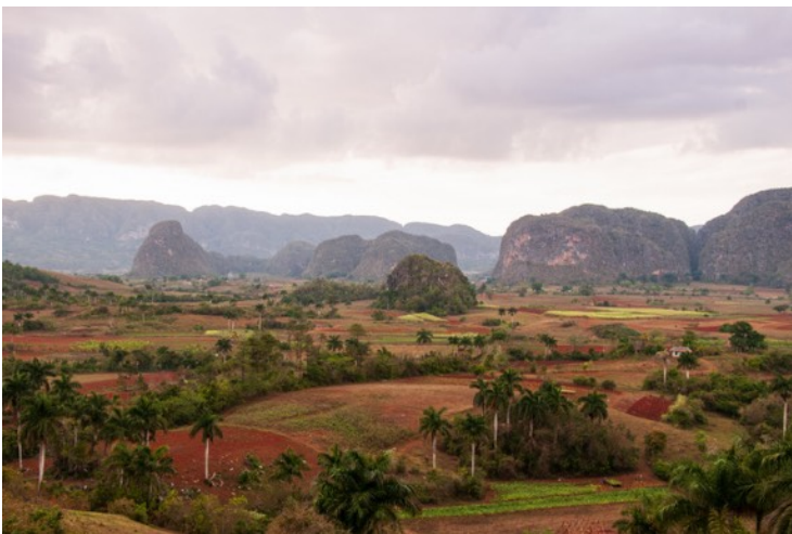
Valle de Viñales

Despite the general lack of a common spoken language (a lot of smiling and gesturing and holding up a camera goes a long way), Anne reported experiencing very few constraints on image making.