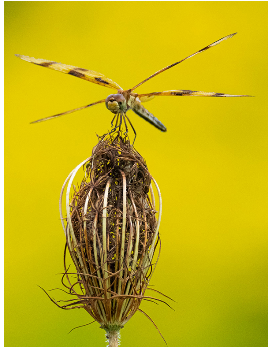
Last of the Dragons