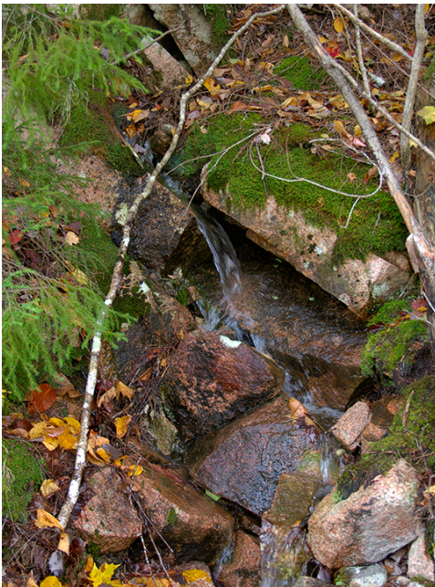
Acadian Rivulet