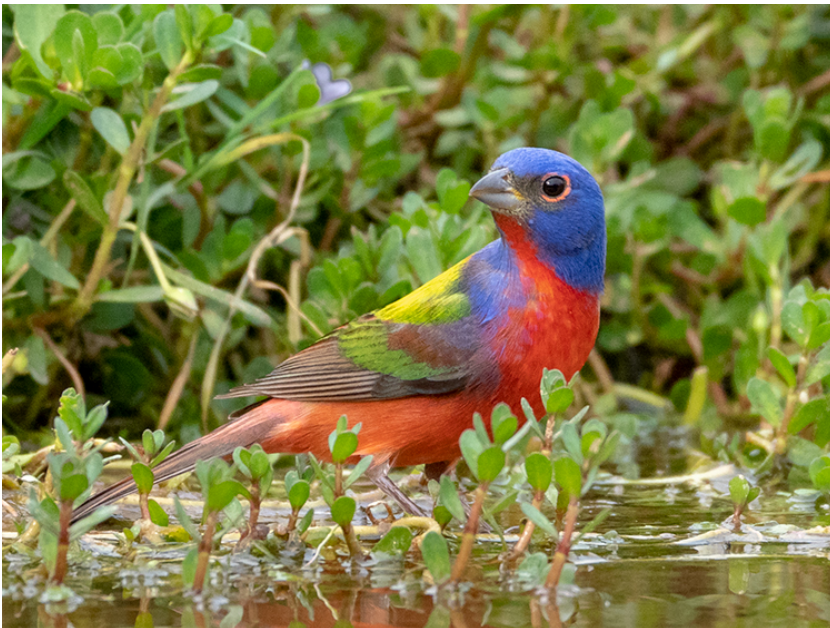
Pretty Painted Bunting; photo, Sue Abrahamsen

In late-April of 2019 Sue Abrahamsen took advantage of two animal photography opportunities in the McAllen Texas area, which is very near the Mexican border close by the Gulf Coast.