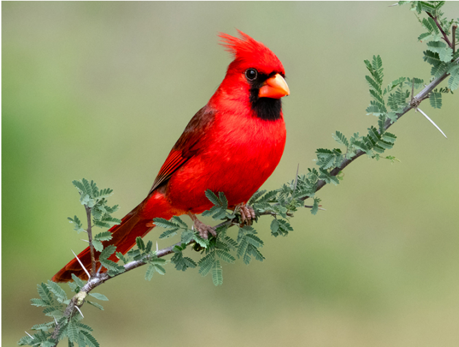
Cardinal