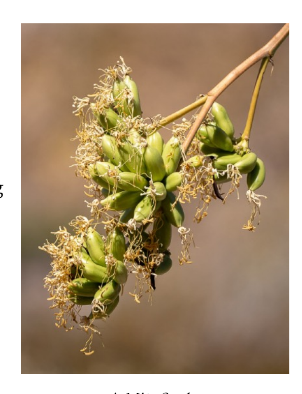
A Mite Seedy